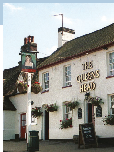
The Queen's Head, Ampthill